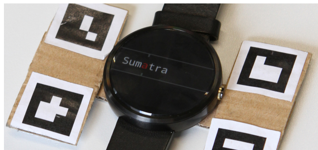
Figure 2. RSVP reading interface with four visual markers augmenting the smartwatch to detect when user's eye gaze is directed at the watch.

Therefore, we implemented an Android Wear RSVP application based on an open source framework 2 for the Motorola Moto 360 smartwatch. The Moto 360 runs Android (version 6.0.1) and has a circular 320×290 pixel 1.56" touchscreen display with a 46 mm diameter. The application displays text, which is shown word by word with a specially colored letter serving as a focal point for the readers eyes to focus on (see Fig. 2). The number of words shown per minute (e.g. 200 words per minute) can be freely selected from the application's setting.