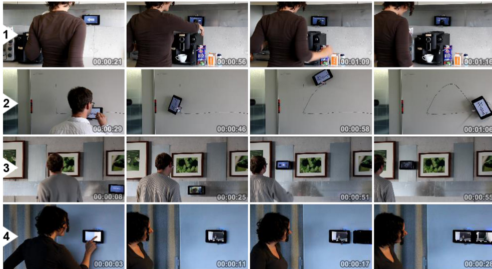
Figure 1: Pictures taken from video prototypes which were implemented in Reference X. 1. kitchen scenario 2. class room scenario 3. museum scenario 4. office scenario (Bader et al. 2015).